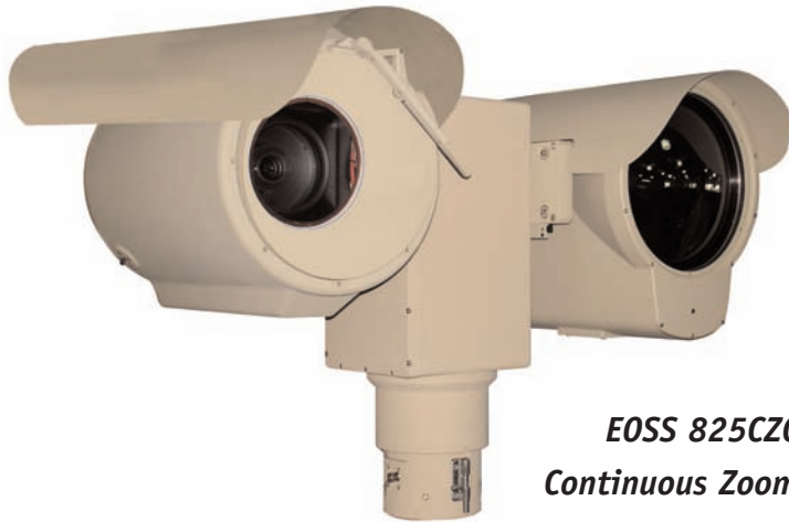
EOSS 825CZC Continuous Zoom

Axsys' EOSS 825 systems offer a highly versatile and reliable Continuous Zoom long-range thermal solution, providing mobile and stationary security. Incorporating a rugged camera with extensive detection capabilities and a remarkable 10X continuous optical zoom, the EOSS 825CZC combines impressive performance with Axsys reliability and ease of use.